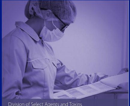
Division of Select Agents and Toxins 2017 Inspection Report Processing Annual Summary